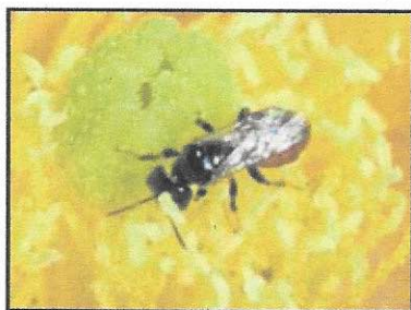
Miner bee on a cactus blossom