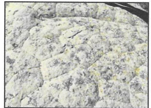
Polygonal jointing seen at White Rocks