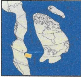
Colorado 77 million years ago

77 million years ago the Niwot area looked radically different than it does today. The Rocky Mountains we know today did not yet exist. In fact, all of what would become Colorado lay beneath a broad, shallow inland seaway that stretched from Utah to western Missouri and from the Arctic Ocean to the Gulf of Mexico. But titanic tectonic forces were about to change everything. About 75 million years ago these forces began the uplift that would create the Rocky Mountains. As the mountains slowly rose, the western shore of the seaway began to retreat to the east. About 67 million years ago this shoreline lay across the Niwot area. Sandy beaches and near-shore deposits were being laid down over the former seabed as the coastline migrated eastward. After millions of years of being later buried by the Laramie and Denver formations, these sands would become the Fox Hills Sandstone. Subsequent erosion over the last two million years or so has removed the overlying younger formations and exposed the Fox Hills here at Niwot White Rocks. The fossils observed in the rocks confirm a near-shore marine environment.